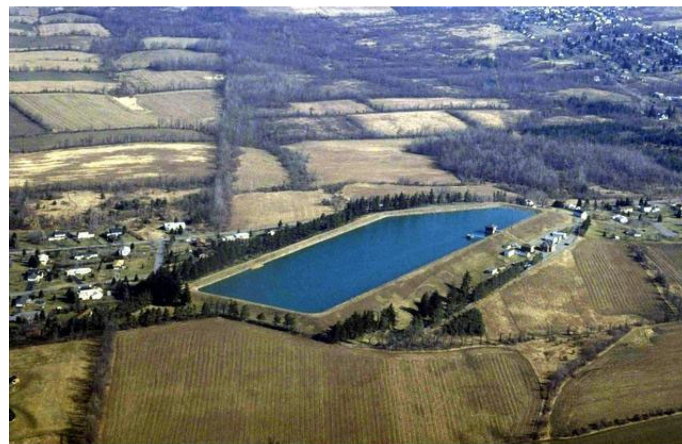
c0000953.jpg Rochester City Hall Photo Lab

Rush Reservoir Image from Rochester Public Library. Reproduced here for educational purposes