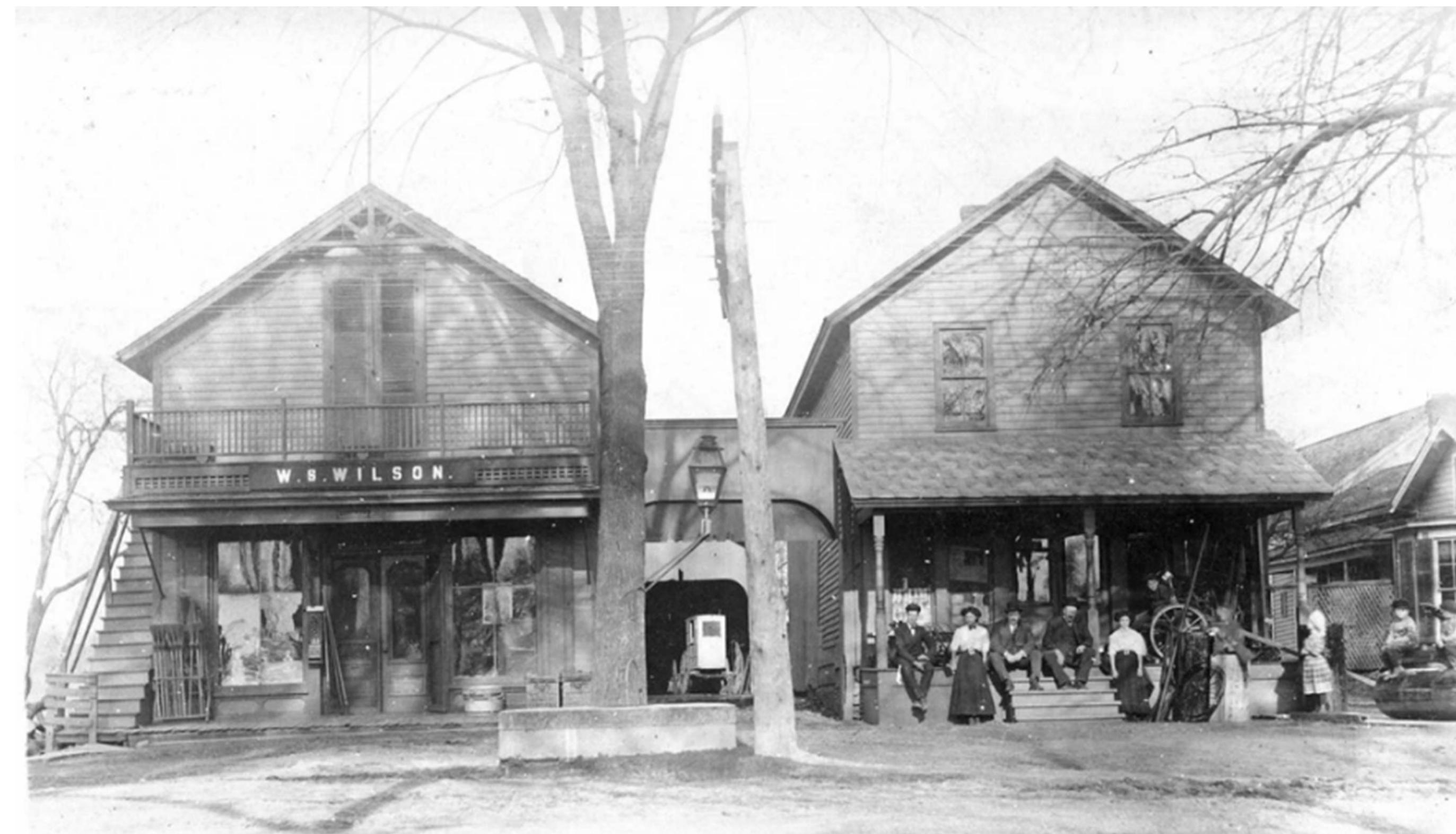
W.S. Wilson General Store in 1908.

Goal: Celebrate and encourage preservation of the Town's historic and cultural resources.